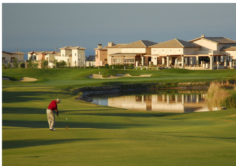
Aphrodite Hills Golf Resort, Pafos