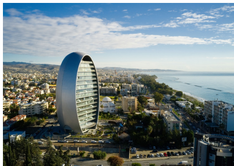
The Oval, Limassol