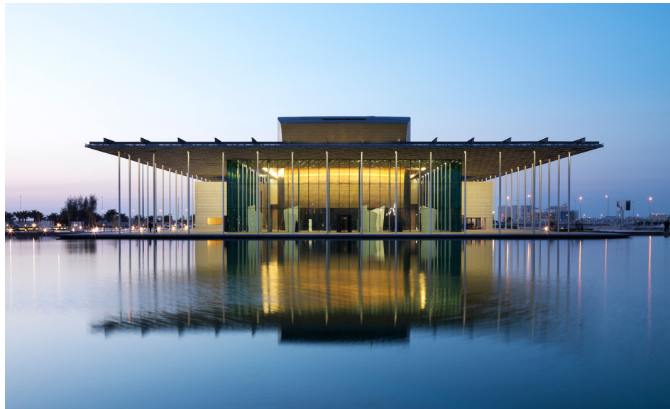
National Theatre of Bahrain

The Group is active in a diverse range of industries, such as: construction, property development, tourism, travel, hotels, transport, leisure and entertainment, restaurants, golf, marinas, energy, trading and agriculture and is also known for its humanitarian and social contribution to culture, education and health.