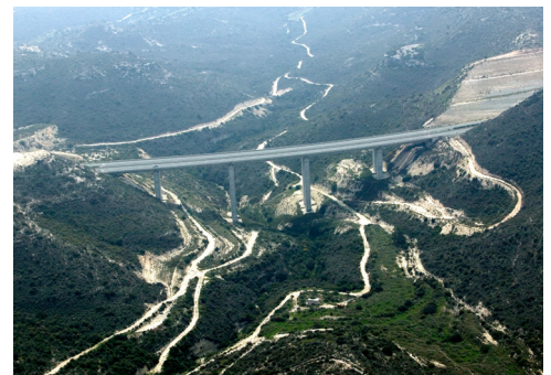
Limassol - Pafos Highway