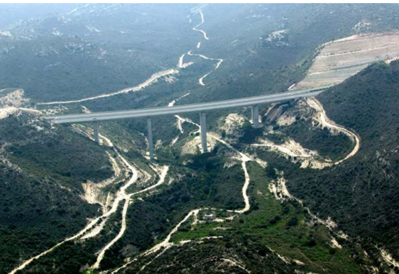
Limassol - Pafos Highway