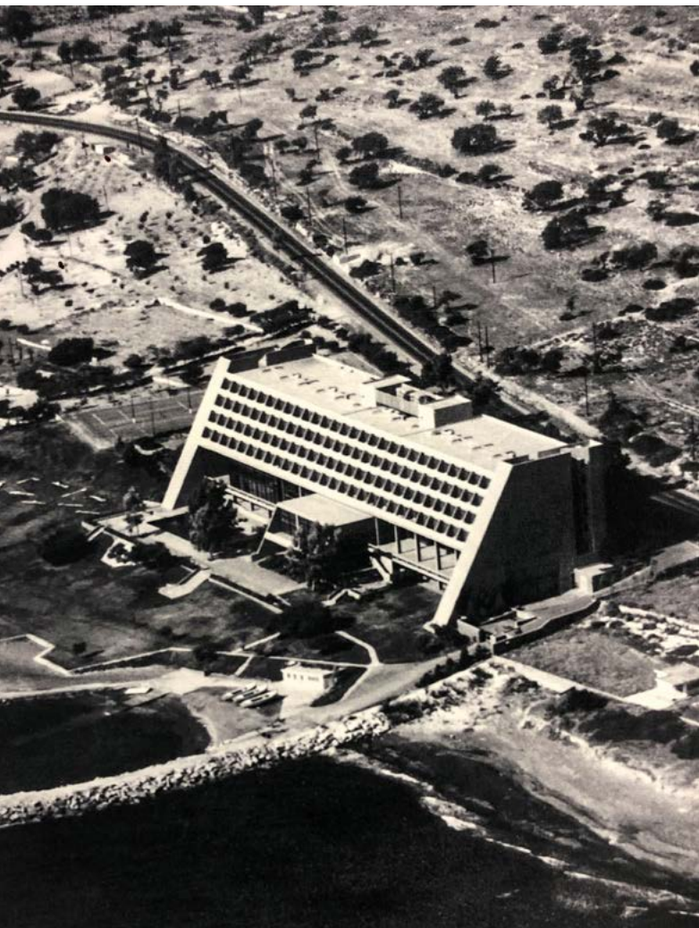
Amathus Beach Hotel, Limassol