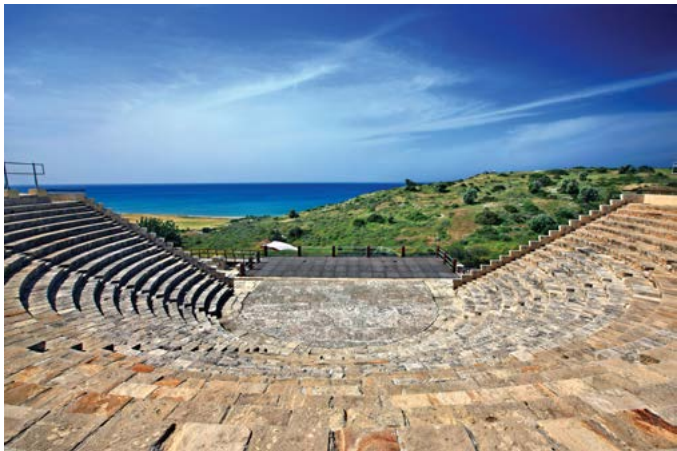
Kourion Ancient Amphitheatre