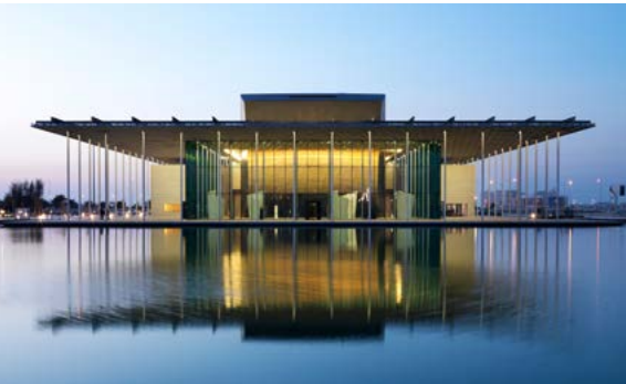
National Theatre of Bahrain