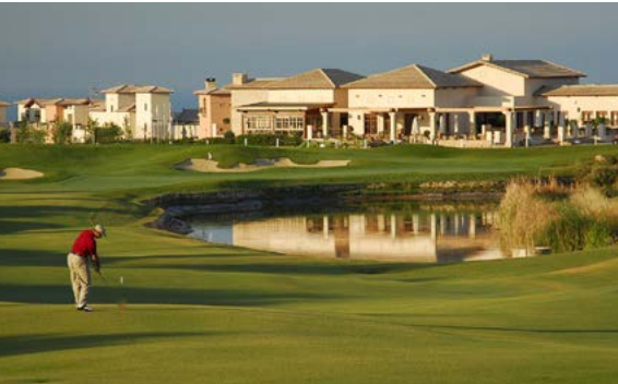
Aphrodite Hills Golf Resort, Pafos