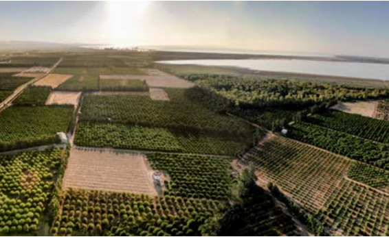
Limassol Greens Golf Resort