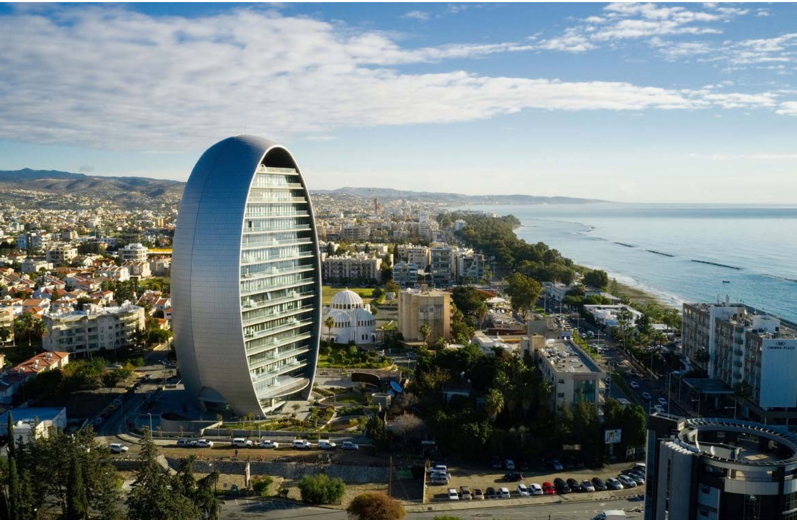
The Oval, Limassol

One of the major contracting companies in Cyprus, with presence in Qatar, Bahrain, Kuwait and Greece. Among its distinguished clients are the Governments of Cyprus, Greece, UK and the Emirates of Qatar, Bahrain and Kuwait. Contracting operations include, among others, luxury housing developments and commercial buildings, terminals and runways, infrastructure, road works, highways and bridges, water dams and power stations.