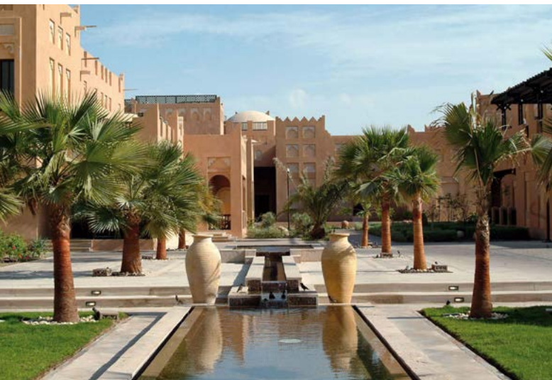
Al Sharq Hotel, Qatar

Part of the prestigious Lanitis Group, Cybarco's long history and solid reputation are behind some of the most significant development, infrastructure, building and civil engineering projects both in Cyprus and abroad.