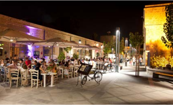
Carob Mill Restaurants, Limassol