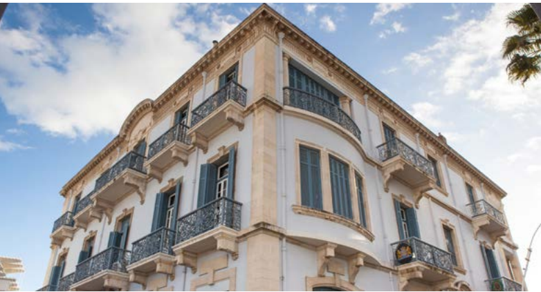
Lanitis E.C. Holdings, Limassol